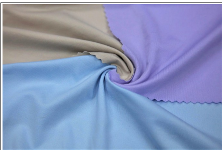
#2705G - NYLON/SPANDEX COOLTOUCH SJ WITH ANTI-BACTERIAL/WICKING