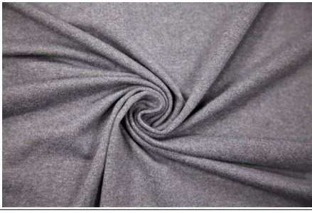
#3793P - NYLON/POLY/SPANDEX COTTON-LIKE SJ 2 SIDE PEACH WITH ANTI-BACTERIAL/WICKING/UV-CUT