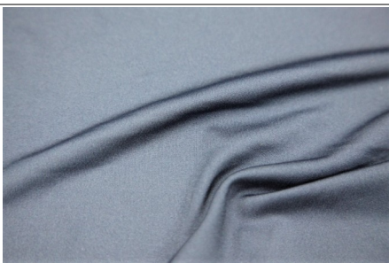
#3818W - POLY/SPANDEX HIGH GAUGE SJ B/SIDE PEACH WITH UV-CUT/WICKING