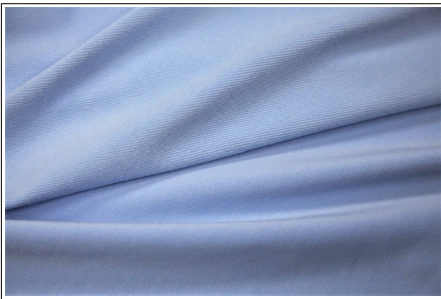
#3818B - POLY/SPANDEX FRENCH TERRY B/SIDE PEACH WITH ANTI-BACTERIAL/WICKING/UV-CUT