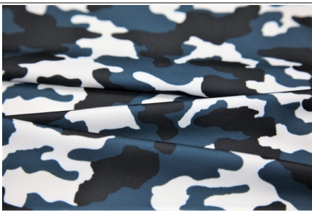
#2142Q - POLY/SPANDEX 4-WAY STRETCH ON ARCTIC CAMO PRINT WITH ANTI-BACTERIAL/WICKING