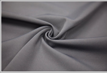
#3528C - YARN DYED NYLON(N66)/BLACK SPANDEX INTERLOCK WITH ANTI-BACTERIAL/WICKING