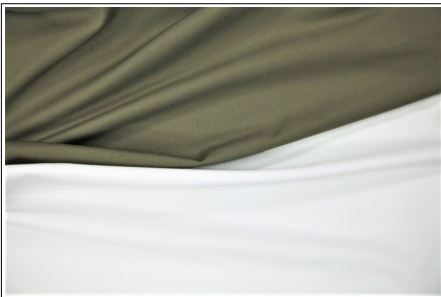
#3714 - MICRO POLY/SPANDEX PREMIUM SOFT WITH WICKING