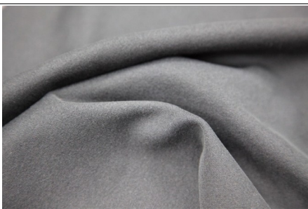
#3775: POLY/T400 ELASTERELL-P NATURAL STRETCH DOUBLE KNIT WITH WICKING/UV-CUT (SORONA YARN) width: 52/54" weight: 242gsm