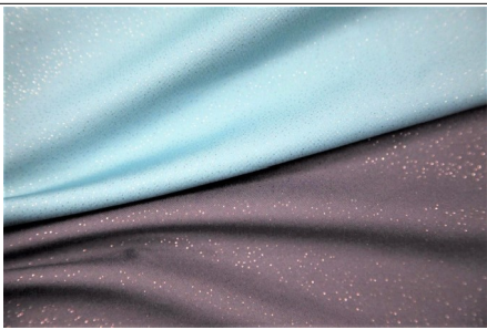
#BM099: RECYCLED POLY/SPANDEX INTERLOCK WITH STARDUST FOIL/WICKING width: 50/52" weight: 272gsm