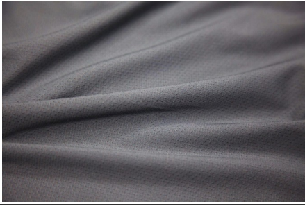
#3603W: NYLON/SPANDEX COOLTOUCH MESH WITH WICKING width: 56/57" weight: 135gsm