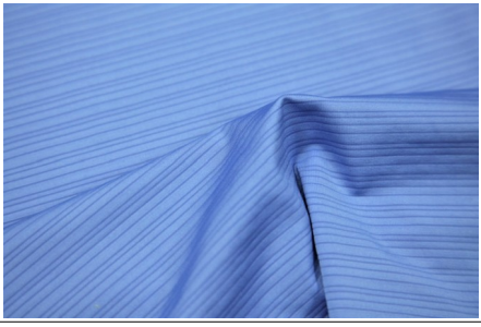
#3502W: NYLON/SPANDEX DRAW STRIPE JERSEY WITH WICKING/ANTI-BACTERIAL width: 56/57" weight: 166gsm