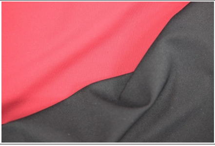
#3529W: YARN DYED NYLON/SPANDEX 2 TONE INTERLOCK WITH WICKING width: 52/53" weight: 235gsm