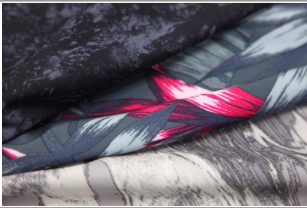
#3464P: POLY/SPANDEX INTERLOCK WITH FLORAL SUBLIMATION PRINT/WICKING width: 50/52" weight: 272gsm