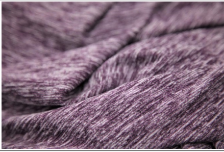
#3813W: ECOYA/SPANDEX SJ WITH 2 SIDE PEACH/WICKING (SOLUTION DYED) width: 50/52" weight: 272gsm