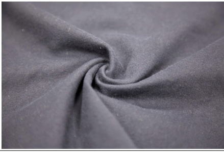
#3571P: YARN DYED ATY NYLON/BLACK SPANDEX COTTON-LIKE SJ WITH WICKING/2 SIDE PEACH width: 60/62" weight: 273gsm