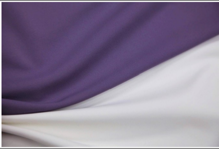
#3528W: YARN DYED NYLON/SPANDEX COOLTOUCH INTERLOCK WITH WICKING width: 50/52" weight: 264gsm