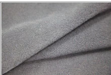
#BM026 - RECYCLED PET POLY/HOLLOW YARN 2 SIDE BRUSH 1 SIDE SHEARED WITH W/R width: 60" weight: 282gsm