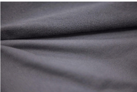
#BM102 - RECYCLED POLY/SPANDEX COTTON-LIKE B/SIDE BRUSH WITH WICKING