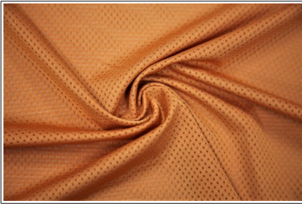
#BM093 - OCEAYA YARN/POLY SJ MESH WITH ANTI-BACTERIAL/ANTI-STATIC/DE-ODORIZING/WICKING (RECYCLED FROM OYSTER SHELL)