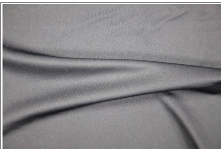
#BM077 - RECYCLED POLY/BLACK SPANDEX SOLID SINGLE KNIT WITH WICKING/ANTI-BACTERIAL