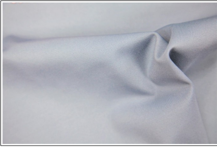
#BM087 - RECYCLED POLY/SPANDEX HIGH STRETCH INTERLOCK WITH WICKING width: 50/52" weight: 272gsm