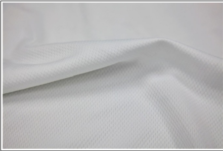
#BM084 - RECYCLED PET POLY BIRDEYES KNIT WITH WICKING width: 60/62" weight: 145gsm