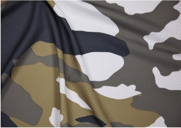
#3566P – POLY/LYCRA 4-WAY STRETCH MESH IN CAMO PRINT (QUICKDRY) 56/58" X 151 gsm