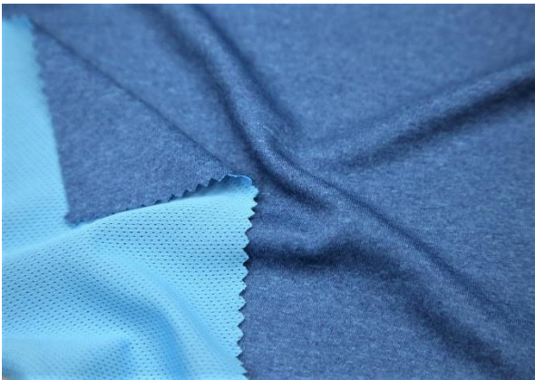
#3801W – POLY/CD 2-TONE DOUBLE KNIT CROSS DYED (PERMANENT QICKDRY) 58/60" X 114 gsm