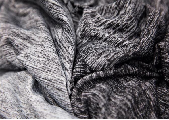
#3535 – GRAPHENE POLY/CD/SPANDEX MELANGE IN GRADUAL EFFECT JERSEY (THERMAL/QUICKDRY)