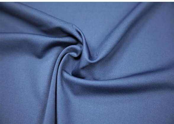
#BM075 – COOLBEST® WICKING YARN/LYCRA JERSEY (PERMANENT COOLING/QUICKDRY)