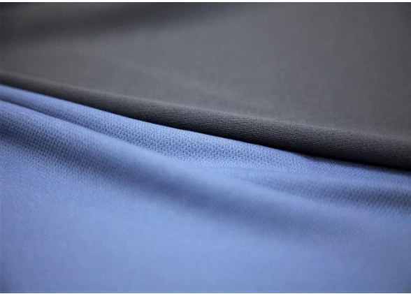
#BM073 – BAMBOO CARBON POLY IN 2-TONE BIRDEYES (THERMAL/QUICKDRY)