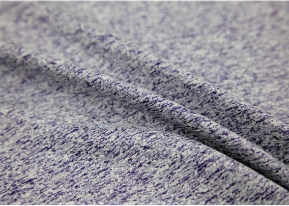
#3542W – POLY/CD/LYCRA MELANGE JERSEY (QUICKDRY/COOLING/ANTI-BACTERIAL) 60/62" X 238 gsm