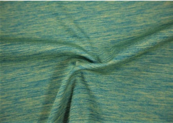
#3764 – HIGH STRETCH POLY YARN IN FANCY WOOLENEX (QUICKDRY) 66/68" X 202 gsm