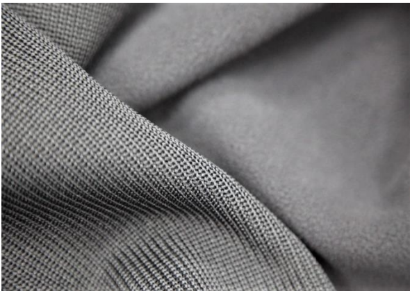
#PF579 – YARN DYED YOKO/POLY WITH FLEECE + ANTI-PILLING (THERMAL/QUICKDRY) 58/60" X 443 gsm