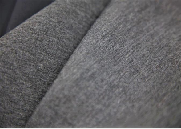
#3815 – MODAL/POLY/SPANDEX SCUBA INTERLOCK (QUICKDRY) 59/61" X 310 gsm